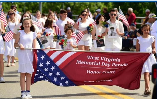
Taylor County Honor Court Students March in the 157th West Virginia Memorial Day Parade

Another longstanding tradition honoring military service will take place on Memorial Day, May 25, with the 159th Annual Memorial Day Parade in Taylor County, one of the oldest events of its kind in West Virginia, dedicated to remembering fallen service members. Click here for the parade lineup.