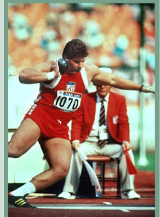
1996 Olympic Silver and Gold Medalist Randy Barnes

On May 31, 1985 , Randy Barnes of St. Albans set a state record in the discus throw. Barnes, who still holds the state record in both the shot put and the discus, won a gold and silver medal in the 1996 Olympic Games.