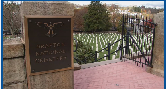
Entrance to the Grafton National Cemetery

Veterans were invited to share perspectives shaped by experiences at home and abroad through creative works celebrating both national and local heritage. The exhibition also highlights West Virginia's longstanding military tradition. The state consistently ranks among the highest in the nation for the percentage of veterans in its population and is home to historic military sites, including Grafton National Cemetery, one of the country's earliest national cemeteries established after the Civil War.