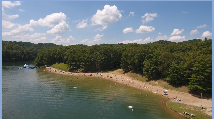
Aerial view of Lake Stephens in Raleigh County

West Virginia Tourism created a list of the best lakes to visit this summer in the Mountain State.